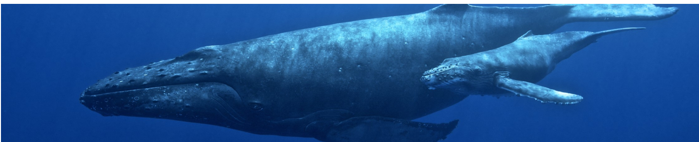
Organisms from tiny plankton to enormous whales create and benefit from connectivity.

Ecological connectivity , the movement of populations, individuals, genes, gametes, and propagules between populations, communities, and ecosystems, as well as that of non-living material from one location to another, is a fundamental ecological process (see Box 1). Effective ecological networks of MPAs are systems of core habitats connected by ecological corridors that are established, restored, and/or maintained to conserve biological diversity in systems that have been fragmented. These networks can be critical tools for sustainable ecosystem-based management. Their successful design and management depends, in part, on identifying, maintaining, and enhancing connectivity among distinct sites within the network. Enhancing ecological connectivity among MPAs improves conservation outcomes by promoting biodiversity, population persistence and resilience, increased capacity to adapt to environmental change, and sustainable fisheries management. 1-4 Well-connected networks of MPAs can also help species and ecosystems adapt to climate change by protecting climate refugia or providing a “safe landing place” for species undergoing range shifts. 5 Ultimately, integrating ecological connectivity into the design and adaptive management of MPA networks can improve conservation outcomes at individual MPAs and throughout the network while potentially reducing the footprint of its individual protected areas.