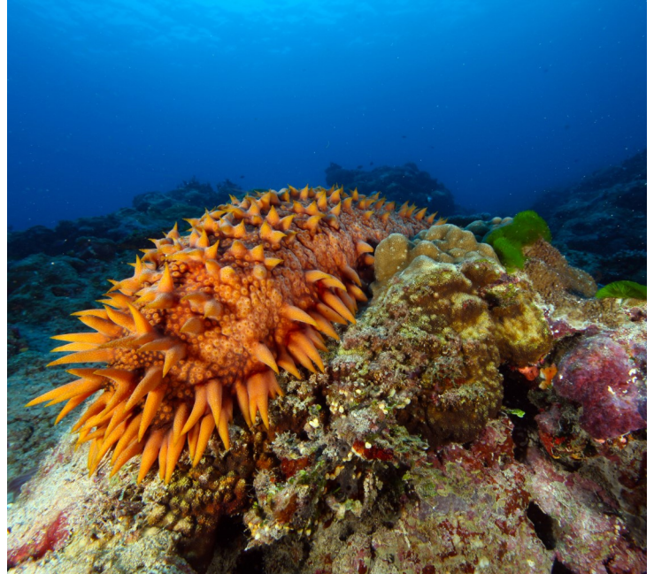
Oceanographic connectivity of larvae is vital to the spread of sessile and slow moving animals.

To effectively make the case for ecologically connected MPA networks, planners, stakeholders, and decision-makers need: (i) increased public awareness and prioritization of marine connectivity, both within and outside of MPAs, to enhance the health of the marine system and the ecological services it provides; (ii) a wider range of robust case studies illustrating the benefits, challenges, and opportunities of addressing connectivity in MPAs; (iii) clear, intuitive conceptual models of how ecological connectivity works, understandable to a variety of audiences; and, (iv) simple ecosystem-specific maps and interactive models illustrating the degree, directionality, and impacts of ecological connectivity in real places relevant to proposed or existing MPAs.