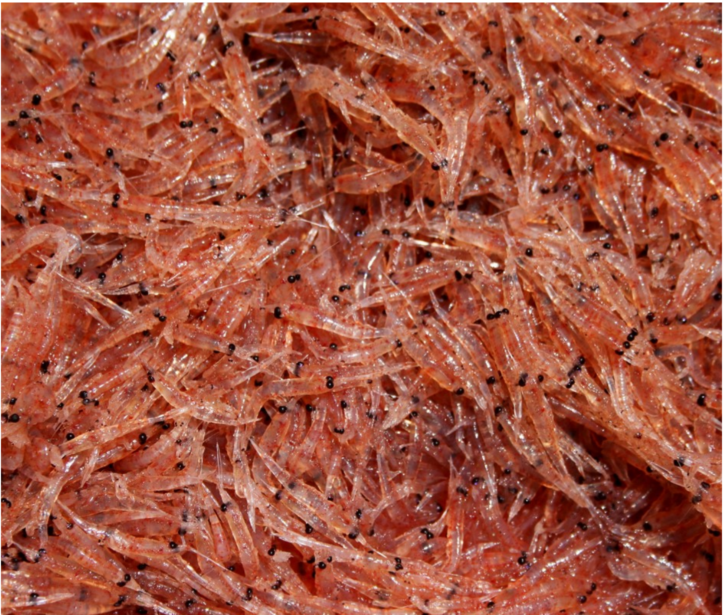
Improved understanding of the connectivity of lower trophic levels is an important information need.

To advance the collective knowledge about how, where, and when ecological connectivity affects MPA resources and ecosystems, there needs to be increased understanding of: (i) the role connectivity plays in different types of ecosystems and communities; (ii) the physical and biological processes that govern connectivity across multiple spatial (e.g., benthic-pelagic coupling in the deep sea) and timescales; (iii) how different trophic levels and/or life history stages contribute to connectivity among sites; (iv) the role of ecological connectivity in understudied species important to ecosystem function; and (v) how climate change may affect the drivers and consequences of ecological connectivity in various ecosystems.