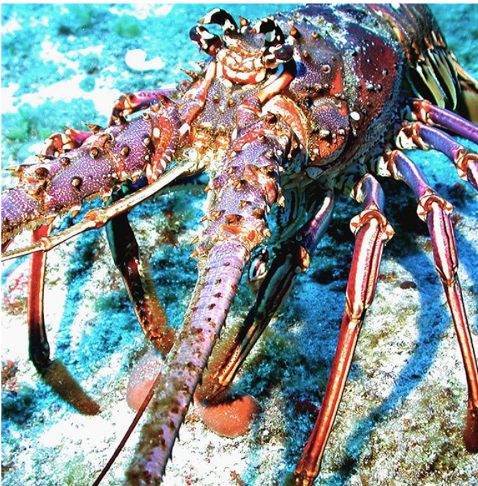
The breeding migration of Caribbean spiny lobsters is one of the strangest displays of connectivity on Earth.

The incorporation of connectivity into the design and management of MPAs and MPA networks presents challenges and limitations. The most robust techniques to document ecological connectivity require complex research efforts, such as genetics or tagging, that may be time- or cost-prohibitive. In addition, climate change can alter migration and larval dispersal pathways by changing ocean hydrodynamics, physiological processes, and the viability of specific habitats. Further, while the focus of connectivity in MPAs has typically been on economically important, charismatic, and/or highly mobile species (e.g., fish and marine mammals), successful implementation of measures to protect ecological connectivity will require improved knowledge of the ecology and connectivity of other species vital to ecosystem function, such as zooplankton, benthic invertebrates and plants, and other forage species. To successfully integrate connectivity into the design and management of MPAs, we must recognize these and other gaps and work to fill them.