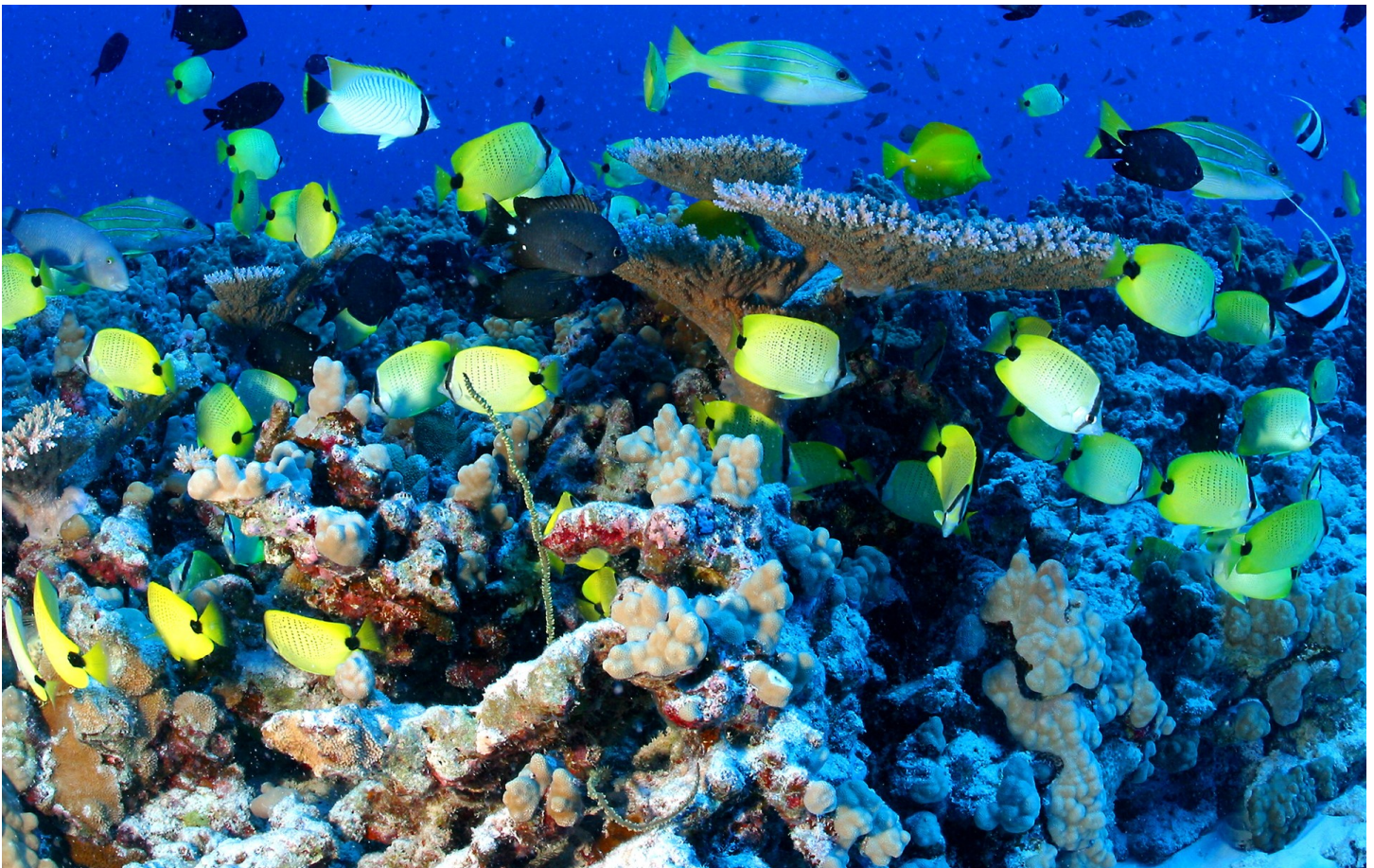
Protecting ecological connectivity can promote and enhance biodiversity in MPAs.