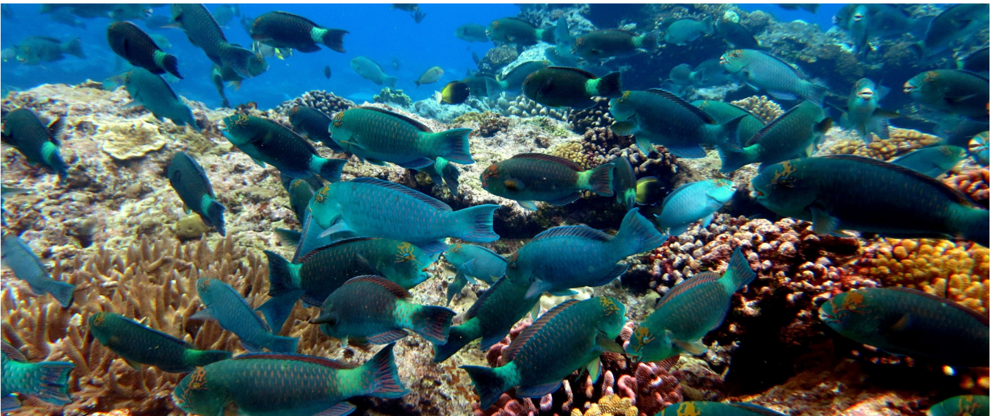
The movement of herbivorous fishes from reef to reef is important to ecosystem health.