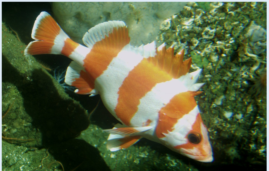
The California MPA network was, in part, designed to preserve connectivity for ecologically important rockfish.

The state's groundbreaking connectivity science was informed by data and models derived partly from commercially and recreationally important fish species, but is careful to consider and provide benefits to the wide range of species necessary to maintain the ecological integrity of California's marine ecosystems. While the design necessarily reflects tradeoffs and considerations of socioeconomic impacts, it is founded on ecological connectivity. California's MPA network provides a robust and evolving model of how connectivity can be explicitly, effectively, and continually applied to MPAs.