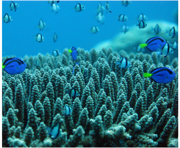
Preserving connectivity can enhance ecosystem resilience by allowing for recolonization after disturbance.

Much of our understanding of connectivity in protected areas is derived from the study of terrestrial areas where the processes creating ecological connectivity can be fundamentally different from those in the ocean. The biophysical nature of the marine realm and deep seas requires the development and application of a new body of knowledge about how to best ensure connectivity is maintained in the ocean. While an increased understanding of connectivity in the ocean will surely help leverage its benefits for MPAs and the surrounding ecosystems, in many situations we already have sufficient knowledge to more fully incorporate it into MPA design and management. Despite the growing evidence of the benefits of connectivity, a recent extensive examination of the application of connectivity in MPAs found that only 11% of MPAs across six global regions explicitly considered connectivity as part of site selection, and that 71% of those were either California State MPAs or Australia's commonwealth marine reserves. 4