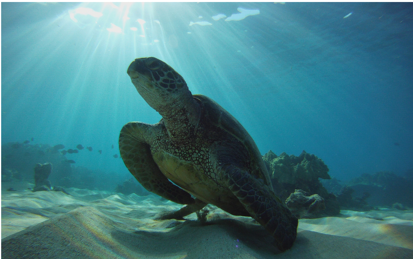
Green sea turtles can travel thousands of miles, connecting marine areas across the ocean.

Incorporating ecological connectivity into the design and management of MPA networks offers a powerful opportunity to leverage a fundamental and wide-spread ecological process. Broadening the focus of MPAs from the protected places themselves to include the ecological processes that sustain them over time is a crucial next step towards designing more effective MPAs and conserving the ecosystem services they provide. Through the explicit incorporation of ecological connectivity into MPA planning, the ocean community can begin identifying and enhancing the ocean corridors that sustain both MPAs and their surrounding ecosystems for this and future generations.