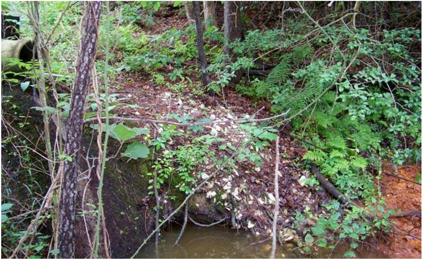
A shell midden on the Rappahannock River erodes around a culvert built to divert rain water into the river. This site has never been formally documented. ( Leslie Reeder-Myers )

Heritage sites are often the primary resource for understanding how humans responded to past climatic regimes, but are sometimes omitted from plans for mitigating adverse climate impacts. With renewed awareness of how climate change may impact cultural heritage, managers can take proactive steps to minimize the impact of climate change on their resources. Some expected changes include: