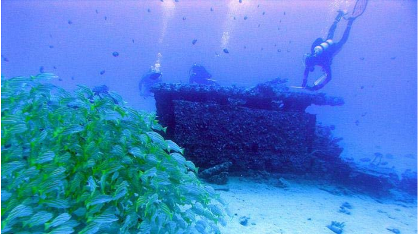
Caption: Submerged cultural resources and the natural environment are intimately related, as evident between the striped snapper and this WWII amphibious landing craft.

At the most basic level, cultural heritage resources within MPAs consist of those tangible and intangible resources that connect us to the environment. Shipwrecks are a primary example of these heritage resources, for vessels of many shapes and sizes are the ubiquitous platform for human experience on the water. The interpretation of wreck sites reveals much about the activities of past seafarers, their ports of call, their cargos, and the nautical technology of the vessel itself. But consider the seascape of the sailor; it's more than just the ship. Anchorages, wharves, navigational aids, lighthouses, channels, harbors and port facilities all capture elements of the past, the remains of which can often be found underwater. And consider the more direct relationship of mariners from the longer pre-industrial age. Canoe construction areas, bays and landings, navigation landmarks, traditional fishing and gathering locations, and the customary knowledge of these places are all intangible elements which preserve the same cultural heritage, even though that knowledge is not focused on a physical property per se. All of these tangible and intangible assets or resources are elements of the maritime cultural landscape. When perceived and understood, they can speak of important past and present human activities, and connections to the marine environment that maintain our cultural identity and life-ways.