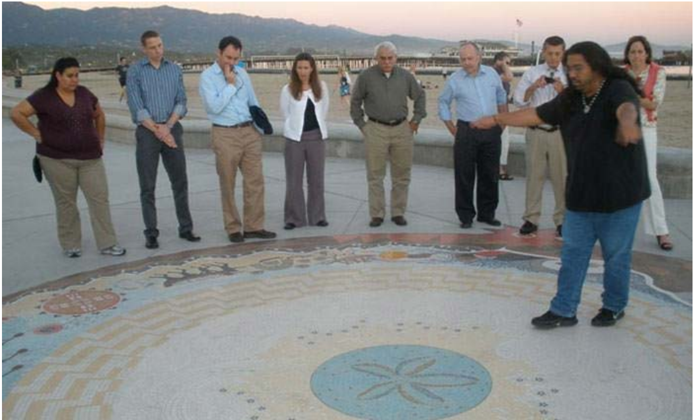
Chumash interpreter telling the story of Syuxtun Story Circle in Santa Barbara, CA.

Stakeholder engagement refers to a variety of ways in which protected area managers reach out to those interested in or affected by protected area management to inform and involve them in management issues. Engagement can be thought of along a spectrum of involvement, from simple awareness to active participation in management activities (such as through citizen science). Examples of engagement strategies include: