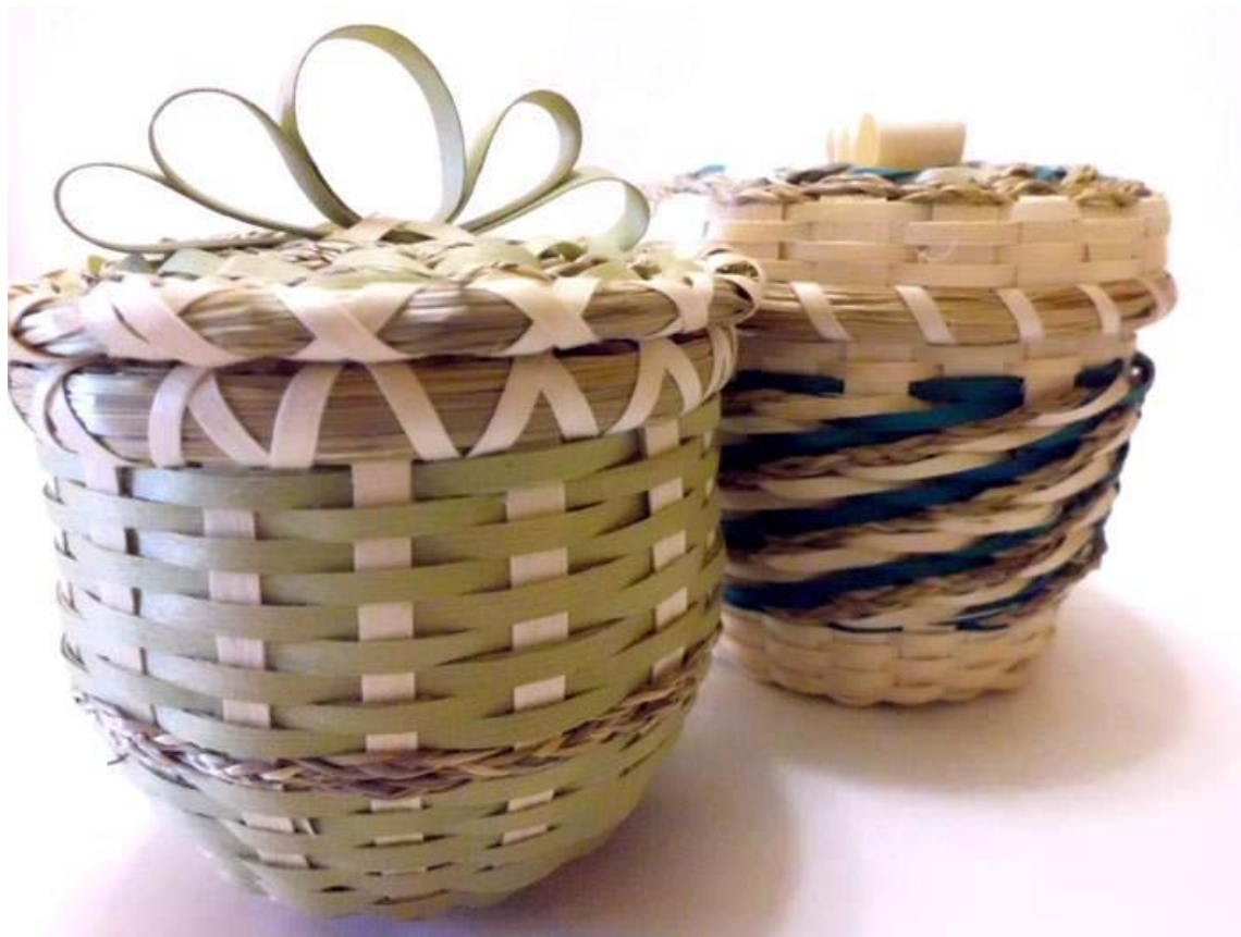
Caption: Wabanaki baskets. ( Bonnie Newsom )

Sound IP and sensitive information protection and management strategies are multi-faceted and should blend legal and non-legal approaches. An effective strategy for addressing IP and sensitive information issues is a management plan that incorporates mechanisms for preventing IP rights violations and provides procedures to protect sensitive information against compromise. An ongoing tribal consultation and community engagement agenda is essential to this approach. Through this process, management can support equitable terms of research, guidance, and policies that address both tangible