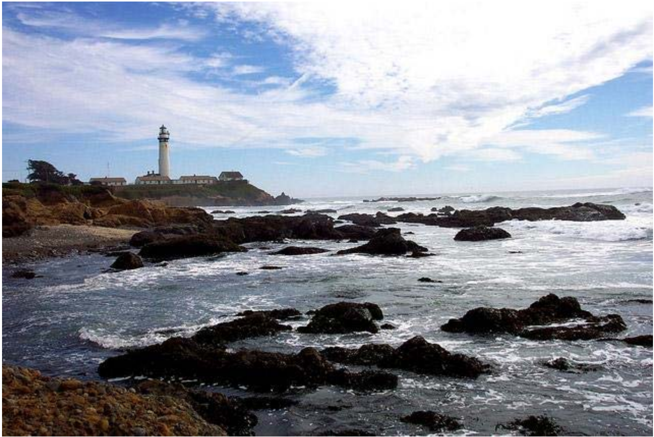
Caption: Lighthouse - Half Moon Bay, CA