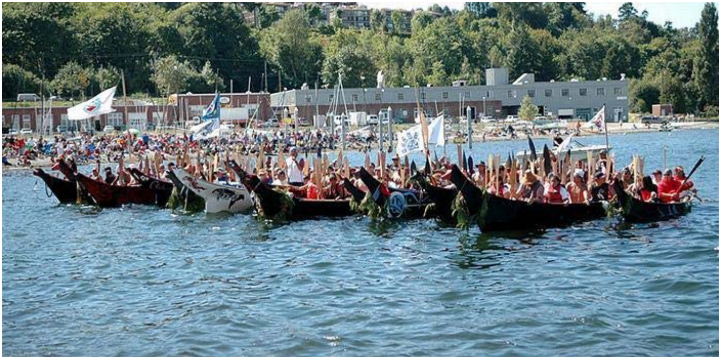
Canoe journey group.

Some indigenous peoples have the legal status of federal recognition by the United States. Regardless of legal status, it is essential to properly consult and build a relationship with any indigenous group with ancestral ties to the resources that may be included in or impacted by an MPA. Proponents of MPAs and managers should identify affected or potentially affected groups and properly inform, engage and work with them. Genuine and robust engagement with affected indigenous communities can significantly enhance the effective management of marine resources. Engagement and consultation should occur throughout the pre-planning, planning, designation, management, monitoring and evaluation phases of MPA development, and when done properly will result in a fruitful relationship with an MPA's indigenous caretakers. Whether MPAs are designated by federal, state, tribal or local governments, MPA managers should make protection of indigenous peoples' historical and legal rights a priority.