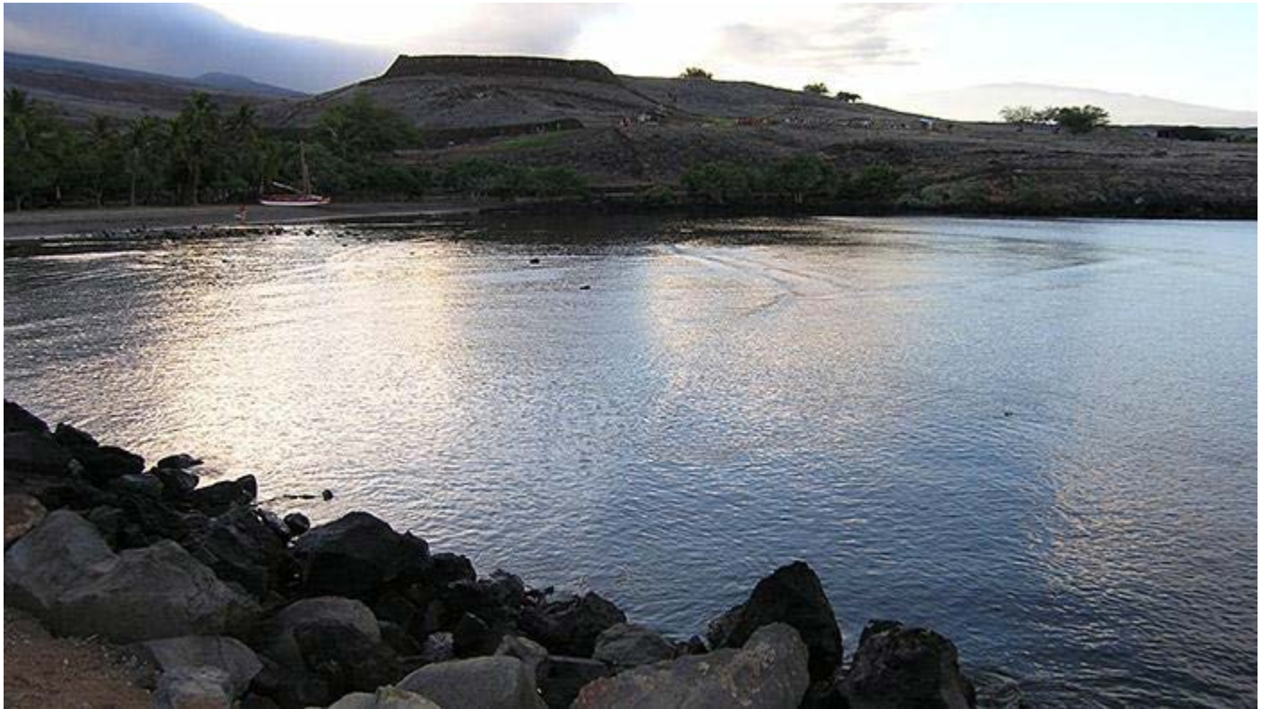
Caption: Viewsheds often have cultural significance. The National Historic Site of Pu'ukoholā Heiau (temple) on the Island of Hawai'i overlooks Hale o Kapuni (submerged) in Pelekane Bay, a site once dedicated to sharks.

With the proper background information, identification of resources, capacity and collaborating partnerships, and an understanding of your MPA's legal responsibilities, you are now in the position to make cultural resource management and preservation a valued part of your formal site management plan. Like any other site resource, this will entail understanding the potential benefits of public outreach and education, the fundamentals of data collection and monitoring and evaluation, handling of potentially sensitive information, and the potential (or real) threats to the resource, such as human impacts and environmental forces. While specific cultural resource strategies and activities may be consolidated in an individual chapter or sub-plan, the cultural landscape approach highlights the fact that cultural influences are part of every management decision for MPAs.