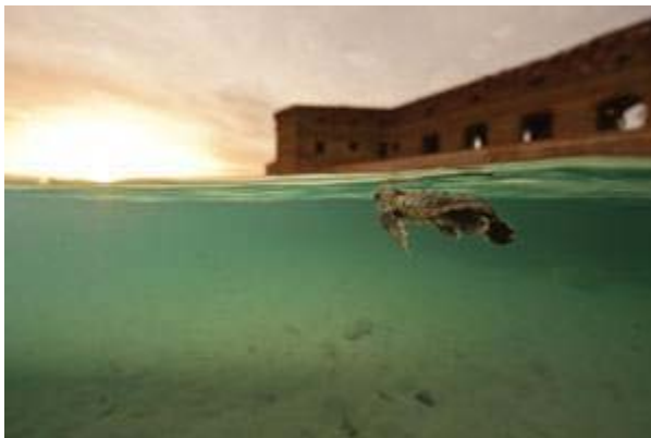
Caption: Sea turtle at Dry Tortugas

Often, sites selected as MPAs have been important to people for decades, centuries, or even millennia. The biological richness or other location attributes made them essential to different cultures and many