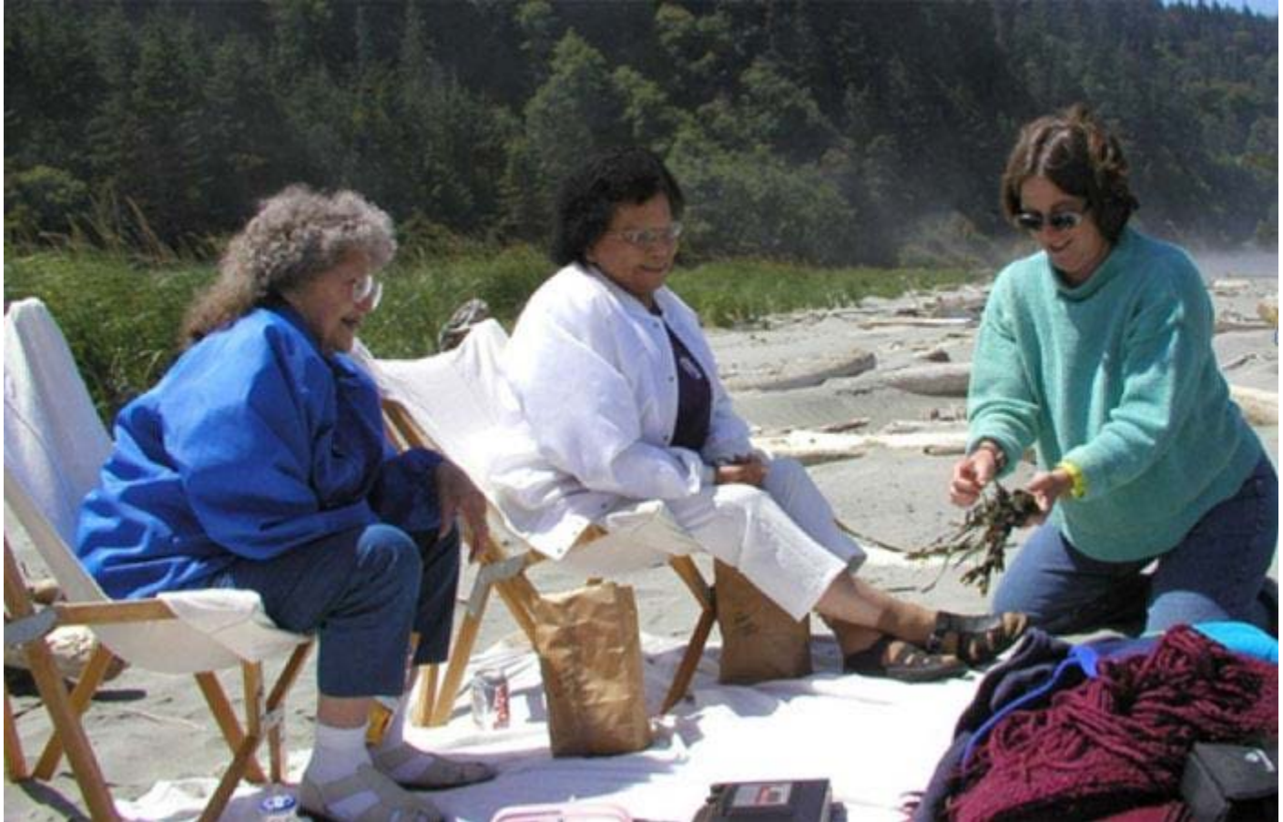
Caption: Tribal members share information about nearshore traditional resources in 2003 at Crescent Bay, Olympic National Park, WA.

Effectively recognizing and understanding cultural resources within a management area can be achieved through community engagement, research and data collection. Submerged archaeological sites, as part of a region's maritime cultural landscape, can be a reflection of international, national, regional, or localized habitation, commerce, industry, immigration, transportation, naval actions, and sacred areas. Researching the cultural history of an area and the interconnections between water- and land-based human activity can elucidate both broad historic patterns and specific activities that may help identify and contextualize individual archaeological sites or culturally sensitive areas.