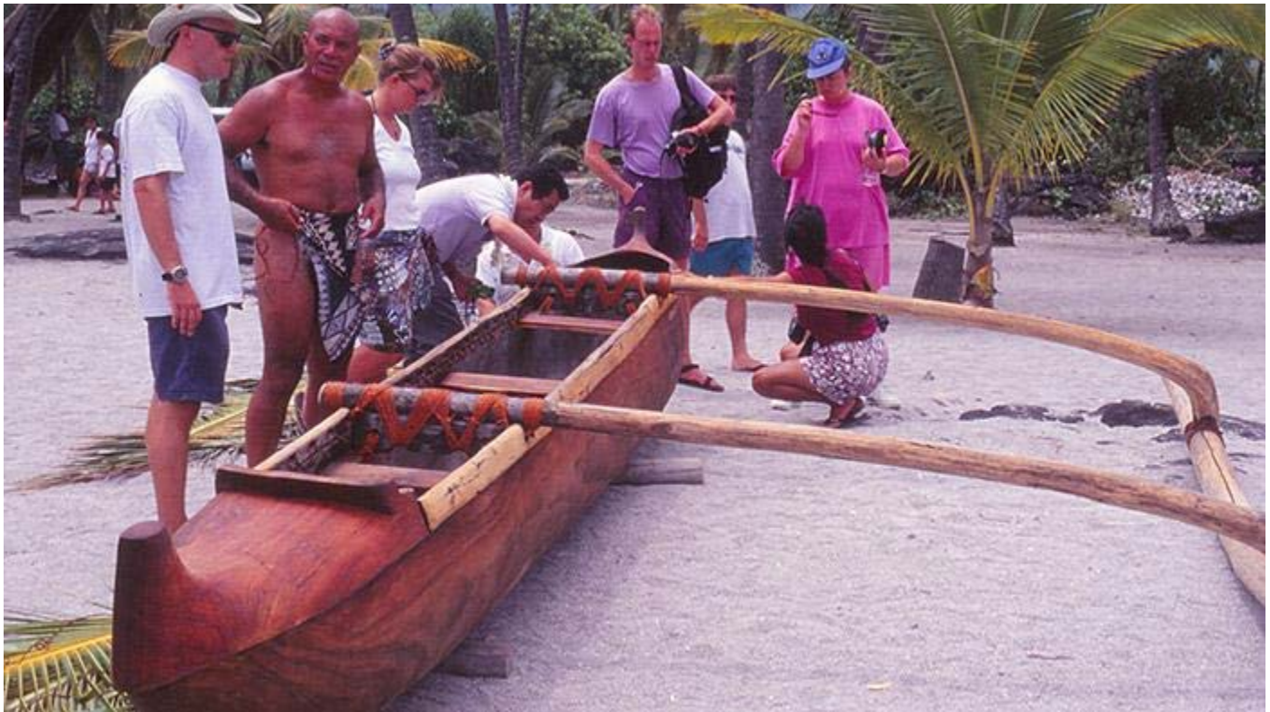
Caption: Marine areas may be significant sites of traditional practices such as canoe launching areas.

Maintaining healthy coastal and marine ecosystems requires a fundamental understanding of the relationships between people and the environment. Adopting a cultural landscape approach can help managers achieve this understanding, as well as engaging new audiences in support of marine conservation goals. A cultural landscape is a place where the intersection of culture and nature leaves a distinct ecological or cultural imprint. A cultural landscape approach is an analytical framework for understanding the ways in which specific cultural and environmental processes overlap and influence one another. In many ways, a cultural landscape approach is analogous to ecosystem-based management – it is a holistic way of looking at places, people and how they form and change one another.