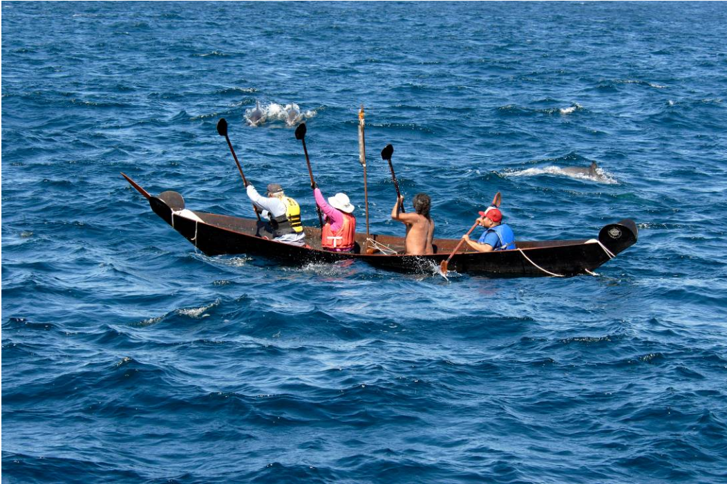
Caption: Chumash annual crossing to Santa Barbara Channel Islands.