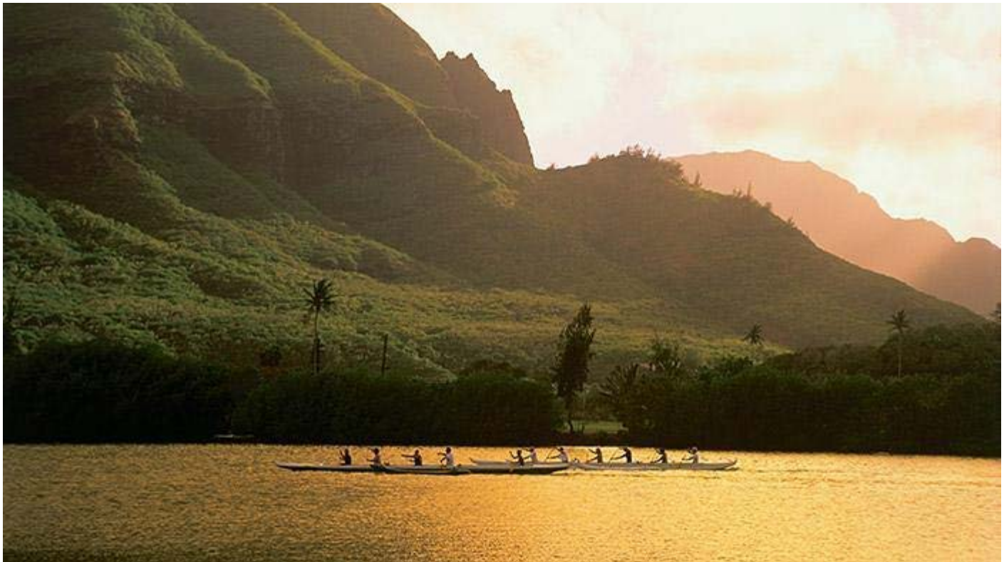
Caption: Canoes along the coast of Hawaii.

Good consultation is part of an overall process of building long-term relationships between the two parties, so methods to sustain those relationships through times of changing leadership should be paramount. Especially important is clear and frequent communication from initial contact to conclusion. In addition, any tribal consultation official or leader of an operating unit, as applicable, should make a reasonable (or good faith) attempt to accommodate a tribal request for consultation.